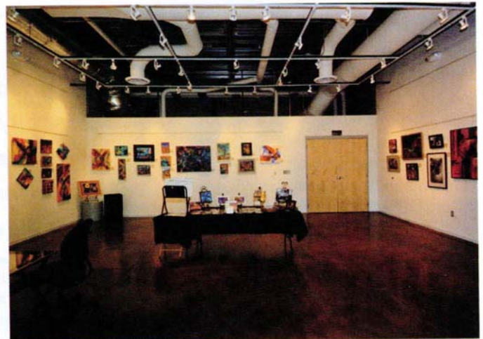
The gallery at Community Performance and Art Center will display the artists work for The Art of Re-Cycle Exhibit.